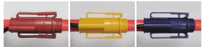
CP-3000-R red connector CP-3000-Y yellow connector CP-3000-B blue connector