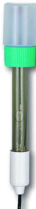
pH electrode ( optional )